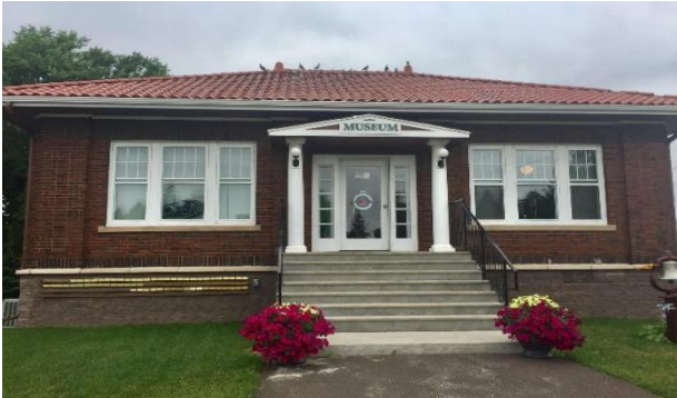
Proctor History Museum

The City of Proctor has incredible year-round activities available. There are biking, ATV and snowmobile trails, city parks, school playgrounds, sports fields, Proctor Golf Course, Proctor Speedway, Historical Museum, Spirit Mountain Recreation Area and the new St. Luke's Proctor Sports and Event Center.