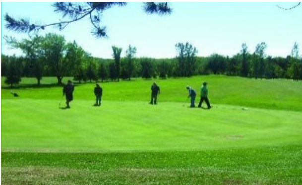
Proctor Golf Course