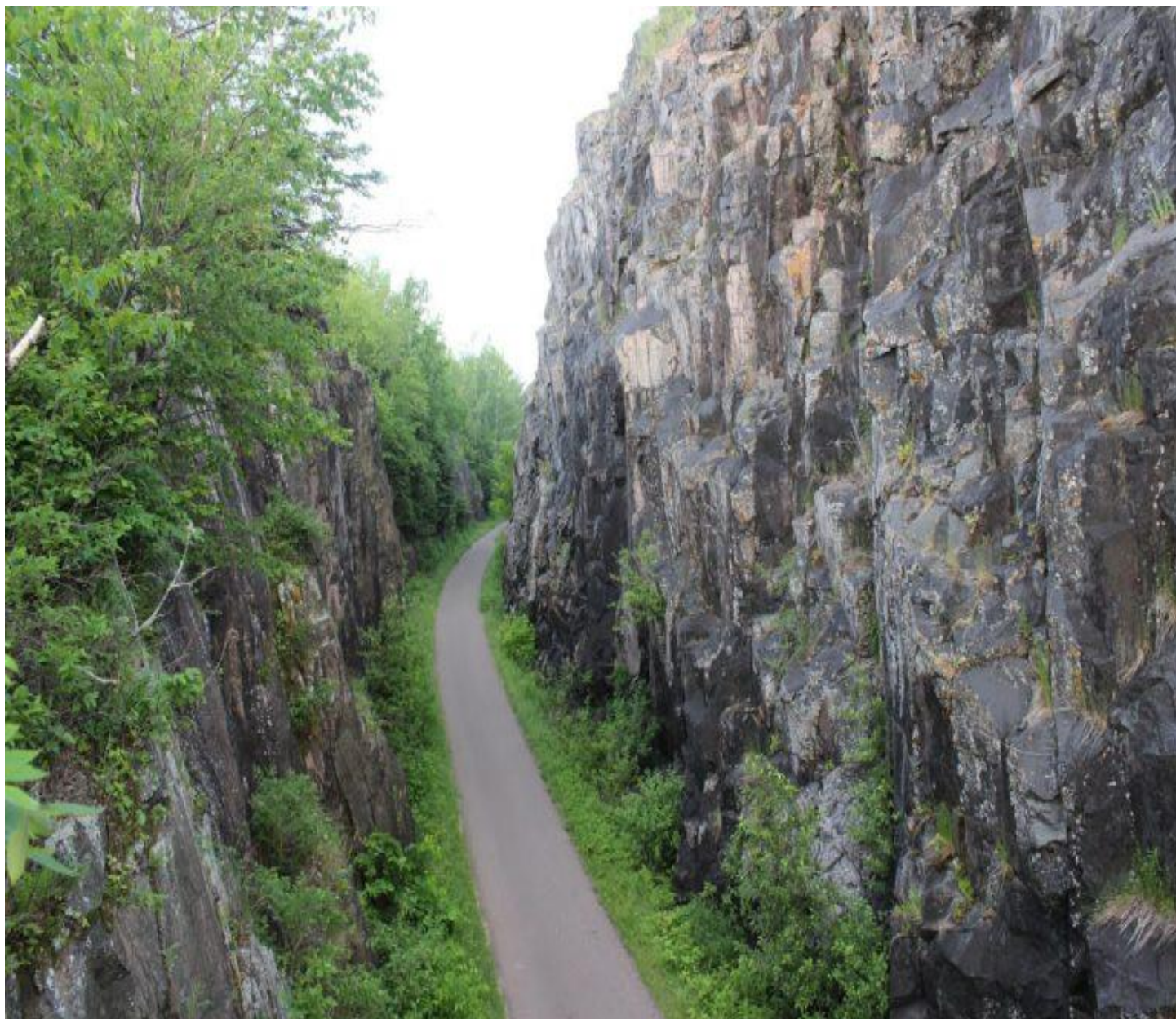
Williard Munger State Trail

You can use our extensive trail system for biking, hiking, snowmobiling and ATVs. Conveniently located at Exit 249 on 1-35, Proctor offers lodging at our three great hotels and many dining and family attractions.