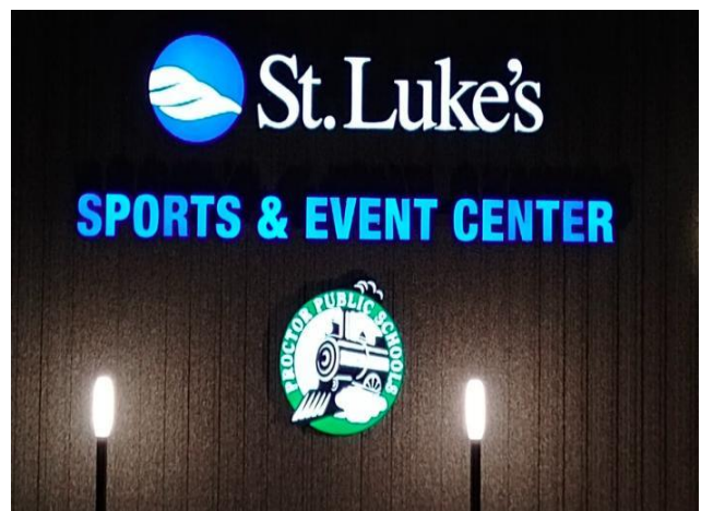
St. Luke's Sports & Event Center